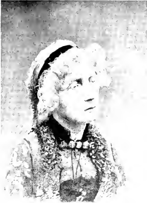
HARRIET BEECHER STOWE.